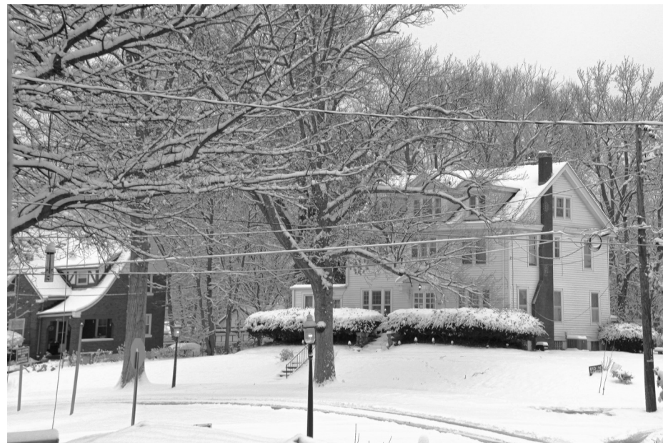
Corner of Dante and Doon under snow.